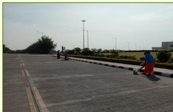
Cleaning campus roads