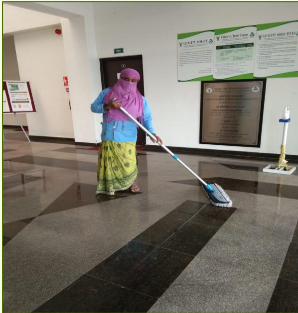
Cleaning at School of Water Stress Management

As a part of 'Swachhata Pakhwada' on day 03 (December, 18, 2020) the premises of office buildings- main/admin building corridors, central lab, canteen and other common areas were cleaned and sanitized.