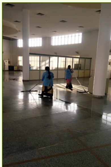
Cleaning and sanitization of office premises, labs and common area