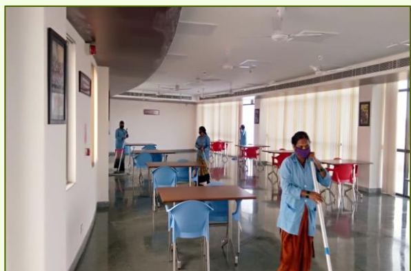
Cleaning and sanitization of institute canteen