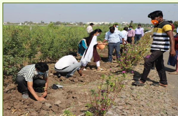
Scientist planting saplings