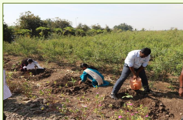
Women participation in the event