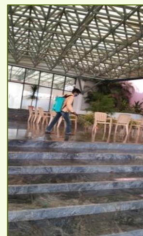
Glimpses of campus sanitization drive