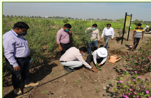
Heads of Schools participated in the event