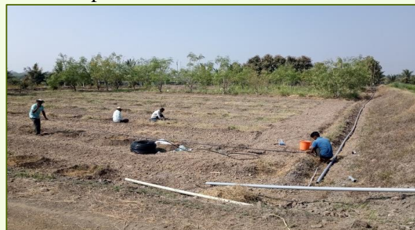
Adoption of drip irrigation in newly established multistoried cropping system