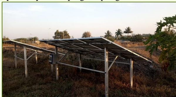
Use of solar pump to lift water from water tank/pond

Dr. H. Pathak, Director, ICAR-NIASM reviewed the progress of the project on December 22, 2020 and suggested to make it climate smart and model Integrated Farming System by developing/adopting different models and computations.