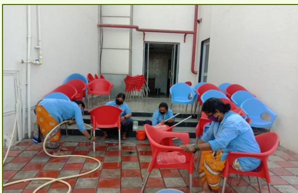
Cleaning & sanitizing canteen facilities -chairs and tables