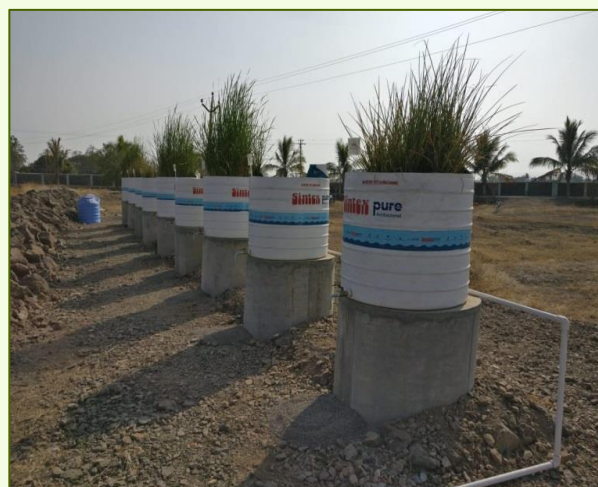
Experimental setups to utilize and improve the quality of sewage water.