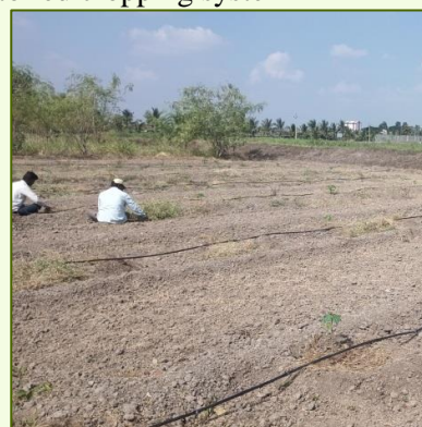
FYM application, manual weeding and mulching as part of organic farming at IFS unit