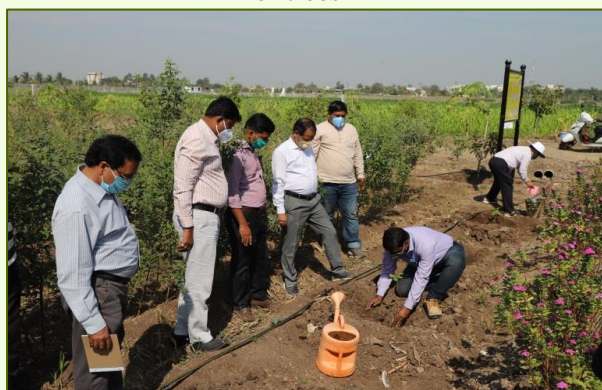
Heads of Schools participated in the event