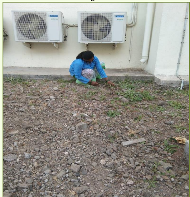
Removing weeds at surrounding areas of schools