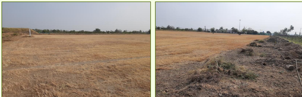
Cleaning and maintenance of sports ground at ICAR-NIASM, Baramati

As a part of 'Swachhata Pakhwada' on day 15 (December, 28, 2020) the grass in the sports ground was pruned and cleaned. The cricket tournament to be organized on 01.01.2021 in the same ground.