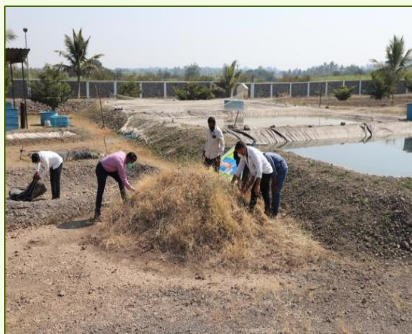
Collection of farm crop/weed residue

At ICAR-NIASM the waste from farm crop/weed residues and garden is being collected and converting into vermicompost. The waste from labs being segregated and disposed properly. Further experiments were also in progress to utilize and improve the quality of sewage water.