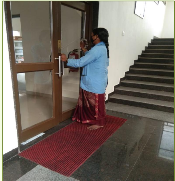
Sanitizing doors at School of Water Stress Management