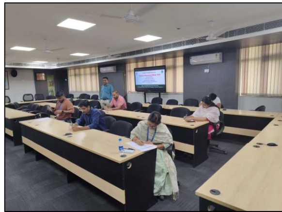
Essay Competition activity