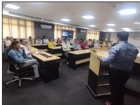
Workshop on Vigilance: Our Shared Responsibility