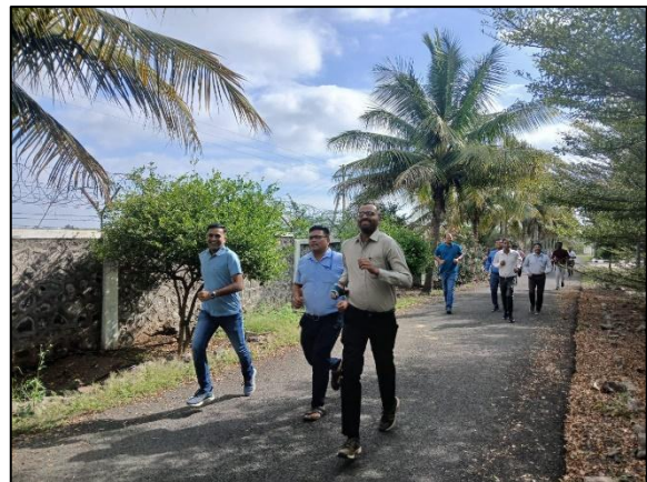
Run for unity